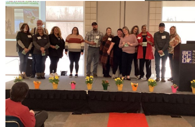
Some of our Wayne County Volunteers that were in attendance.