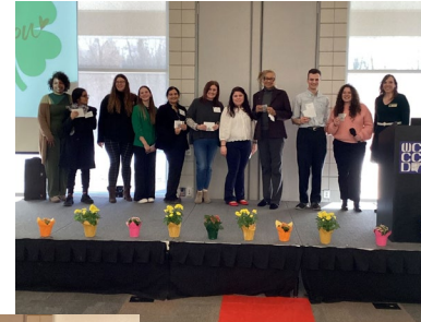
Event Planning Committee

The impact of the 2023-2024 Wayne County 4-H Recognition Event was felt deeply by all who attended. Youth members expressed how meaningful it was to be recognized for their hard work, with one award recipient stating, "Receiving this award made me realize how much I've grown through 4-H and how supported I am by this community." Volunteers also shared how much it meant to be appreciated, with a long-time leader commenting, "Seeing the youth take center stage in planning and presenting this event shows how 4-H truly empowers young people to lead."