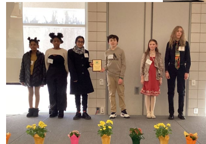
STEM 4-H Club accepting the Outstanding 4-H Club Achievement Award